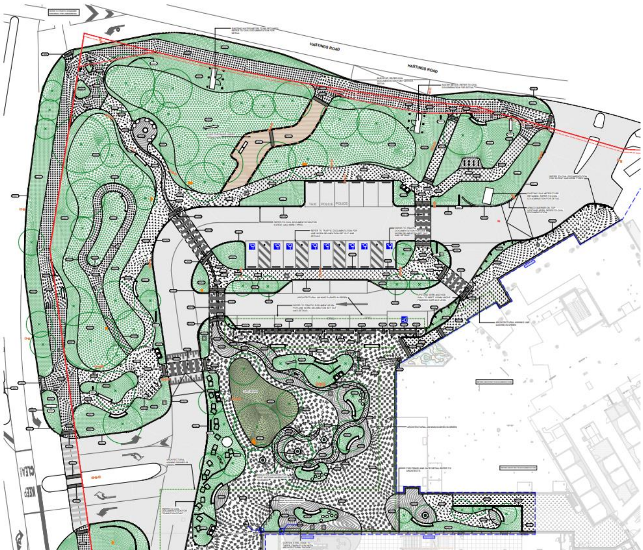
Fig 4.3.1: Arrivals Garden finishes plan