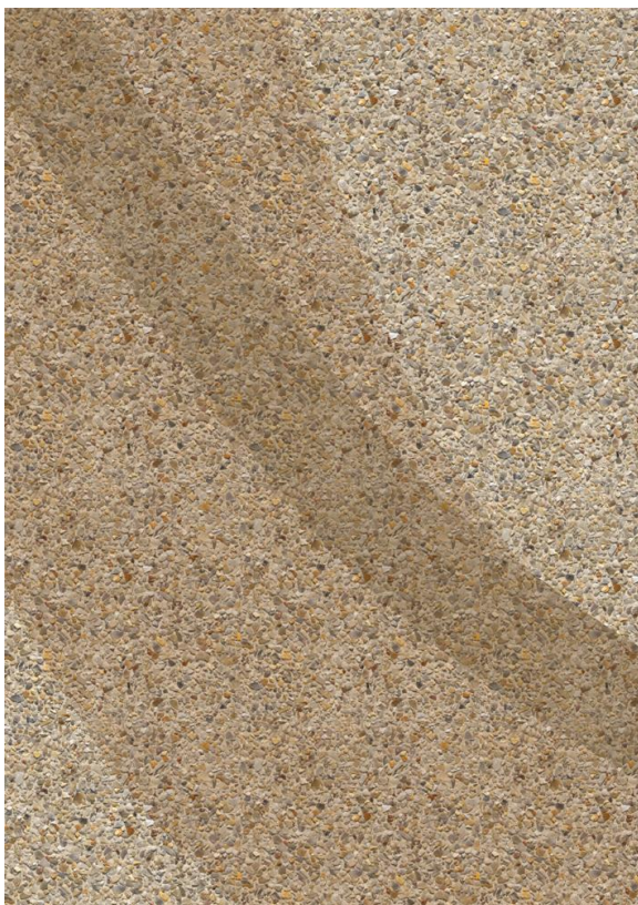
Fig 4.3.3: Indicative design intent for the contrasting exposed aggregate concrete