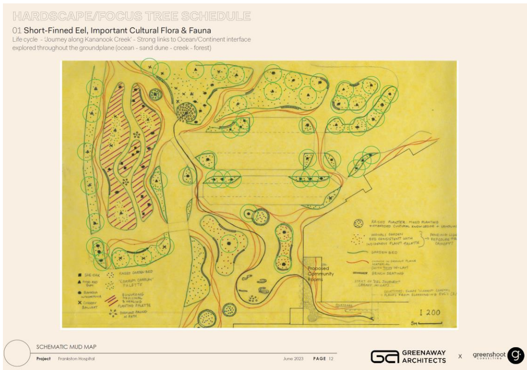
Fig 5.2.2: Early concept images of the Short-finned Eel migration patterns and the 'Journey along Kananook Creek' by Greenaway Architects