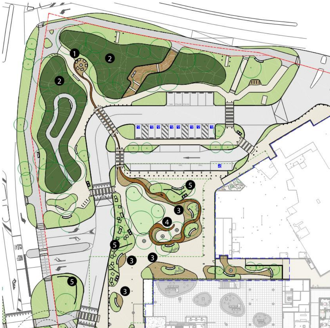
Fig.4.2.1: Arrivals Garden